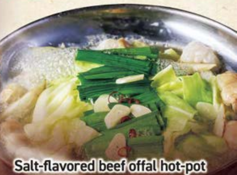
Salt-flavored beef offal hot-pot