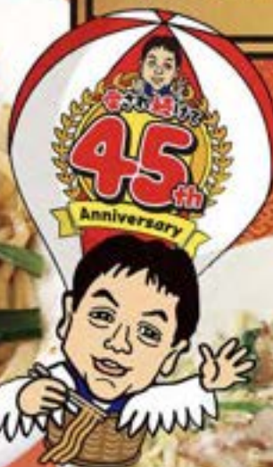
Stir-fried noodles with salt-based sauce 690yen (759yen including tax)