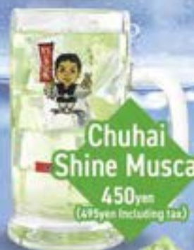
Chuhai Shine Muscat 450yen (495yen Including tax)