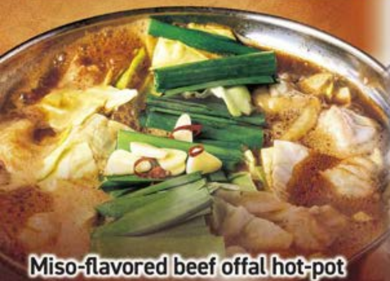
Miso-flavored beef offal hot-pot

For more details about the hot pot, please feel free to ask our staff.