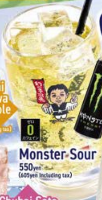
Monster Sour 550yen (605yen Including tax)