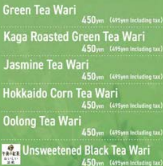
Jasmine Shochu + Jasmine Tea 450yen (495yen Including tax)