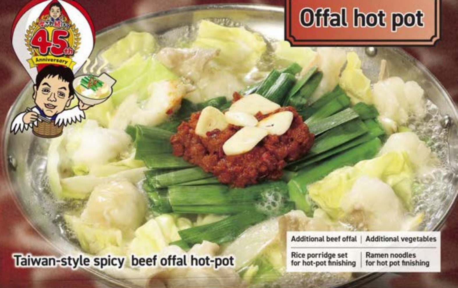
Taiwan-style spicy beef offal hot-pot

Additional beef offal Additional vegetables Rice porridge set for hot-pot finishing Ramen noodles for hot pot finishing