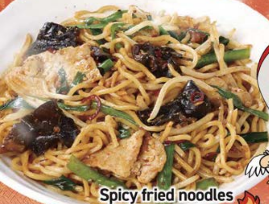
Spicy fried noodles 780yen (858yen including tax)