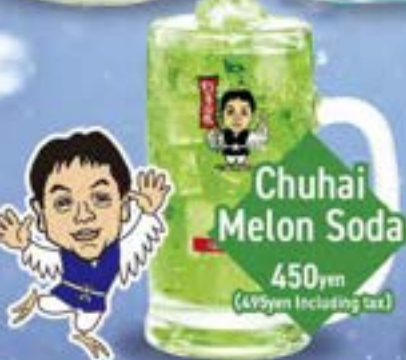
Chuhai Melon Soda 450yen (495yen Including tax)