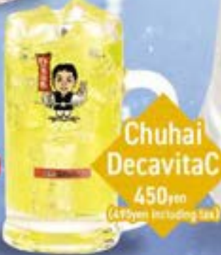
Chuhai DecavitaC 450yen (495yen Including tax)