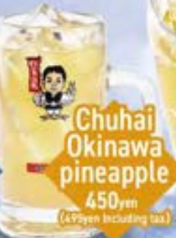
Chuhai Okinawa pineapple 450yen (495yen Including tax)