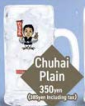
Chuhai Plain 350yen (385yen Including tax)

A refreshing aroma and taste from six kinds of Japanese citrus fruits.