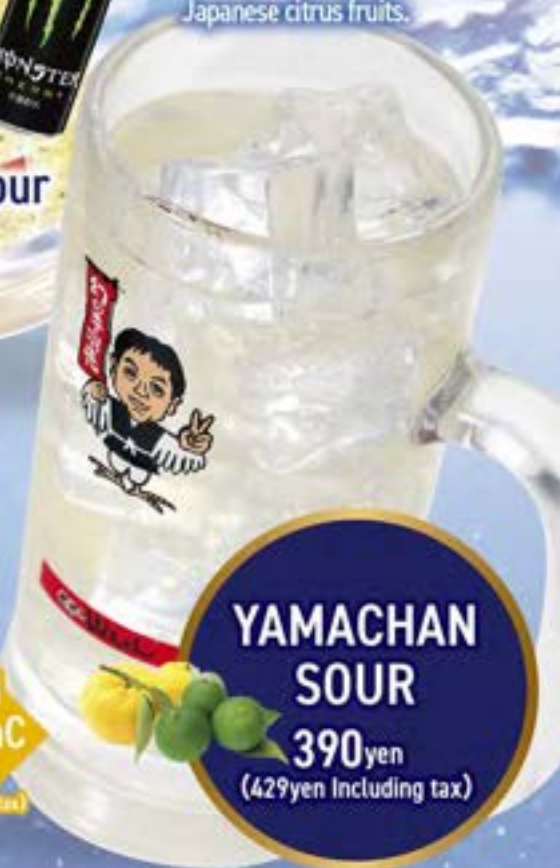
YAMACHAN SOUR 390yen (429yen Including tax)