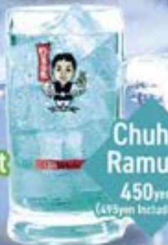
Chuhai Ramune 450yen (495yen Including tax)