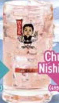
Chuhai Sato Nishiki Cherries 450yen (495yen Including tax)