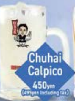
Chuhai Calpico 450yen (495yen Including tax)