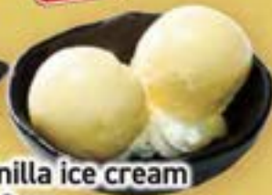
Vanilla ice cream 330yen (363yen including tax)