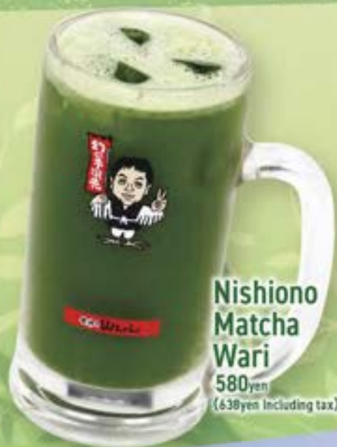
Nishiono Matcha Wari 580yen (638yen Including tax)